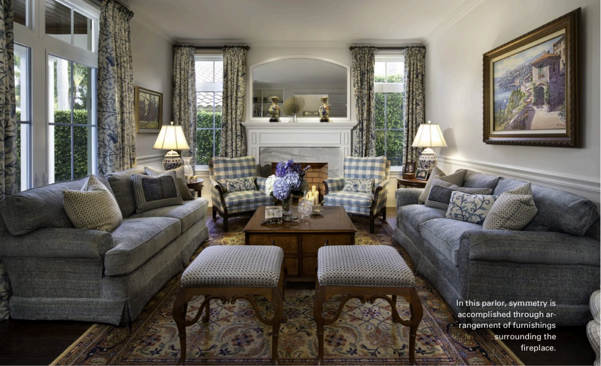
In this parlor, symmetry is accomplished through arrangement of furnishings surrounding the fireplace.

style, the parlor is an integral component of the main living area that spans the first floor.