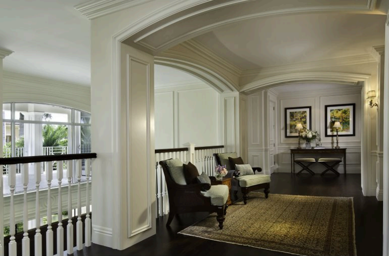
A dark stained console table crowned with lamps and art adds interest and creates a focal point at the end of the second-floor hallway.