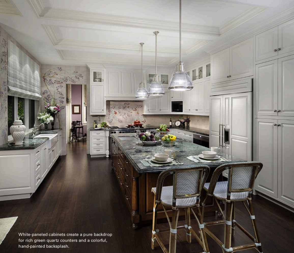
White-paneled cabinets create a pure backdrop for rich green quartz counters and a colorful, hand-painted backsplash.

“We spent many hours coming up with various ideas to solve the coffered ceiling problem, while keeping the full-height windows that were specified. Our first mission was to find a solution that would make the client happy by giving them the ceiling details they desired,” he says. “The solution was very tricky to accomplish, but the result is nothing short of a miracle – coffered ceilings that look like they were designed and fitted from day one, and a thrilled client who got what they wanted.”